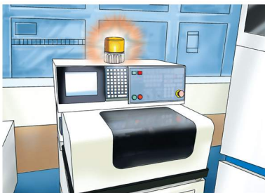
CNC machine equipped with S125U