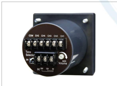
Terminal box for power and sound (back side)